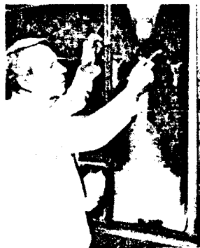
"Analysing Body Structure"