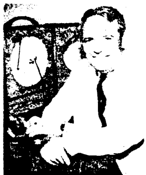
"Monitoring Function" (Cardio-Vascular)