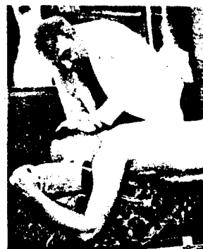
"A Corrective Adjustive Procedure"