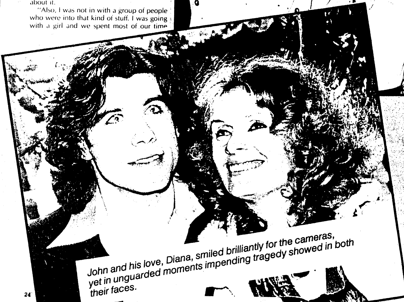
John and his love, Diana, smiled brilliantly for the cameras, yet in unguarded moments impending tragedy showed in both their faces.