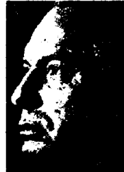
L. Ron Hubbard: An evil drug-abusing dictator?

“He was held for nearly 48 hours in the chain locker of the flagship Apollo,” he says. “His knees and hands were raw with cuts and bruises from chipping rust.”