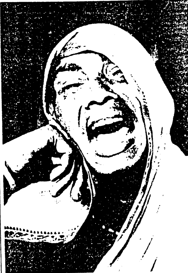
FAMILY LOST: A woman cries at her home in Bashkhali, Bangladesh, over the loss of her daughter and two grandchildren in the cyclone