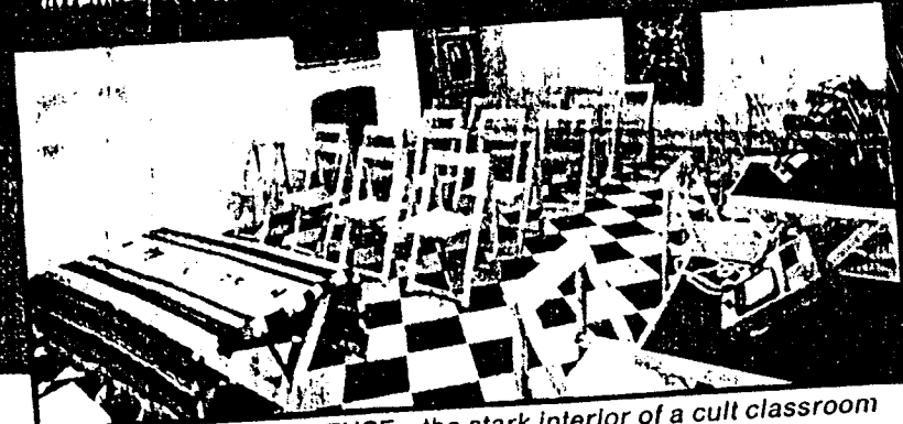
BEHIND THE OPULENCE...the stark interior of a cult classroom