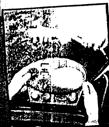
INTERROGATION...with an E-meter