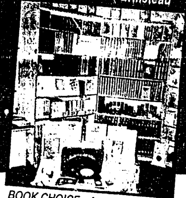
BOOK CHOICE...for brainwashing